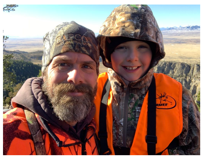
Photo 1. Alberta hunters have expressed an interest in providing meaningful data to assist in the management of game species, identify conservation needs, and provide better information to help with planning future hunts. Through the iHunter Alberta app, ABHuntLog enables anonymous, self-submission of observational data that will help achieve these outcomes.