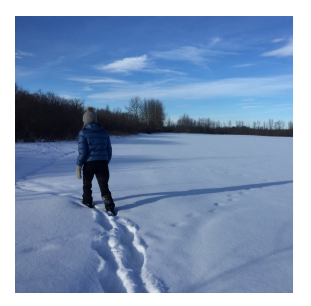
Photo 2. ABHuntLog participants are encouraged to submit wildlife observations year-round. The ABHuntLog survey allows participants to identify as hunters, outfitters, outdoor recreationists, or Métis harvesters.

Photo 1. Alberta hunters have expressed an interest in providing meaningful data to assist in the management of game species, identify conservation needs, and provide better information to help with planning future hunts. Through the iHunter Alberta app, ABHuntLog enables anonymous, self-submission of observational data that will help achieve these outcomes.