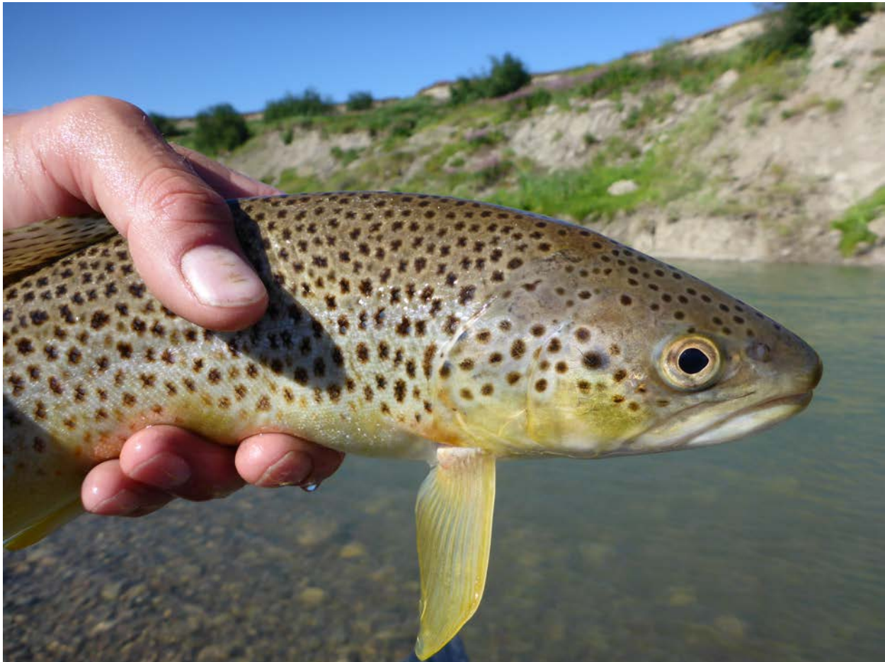
Brown trout close-up.