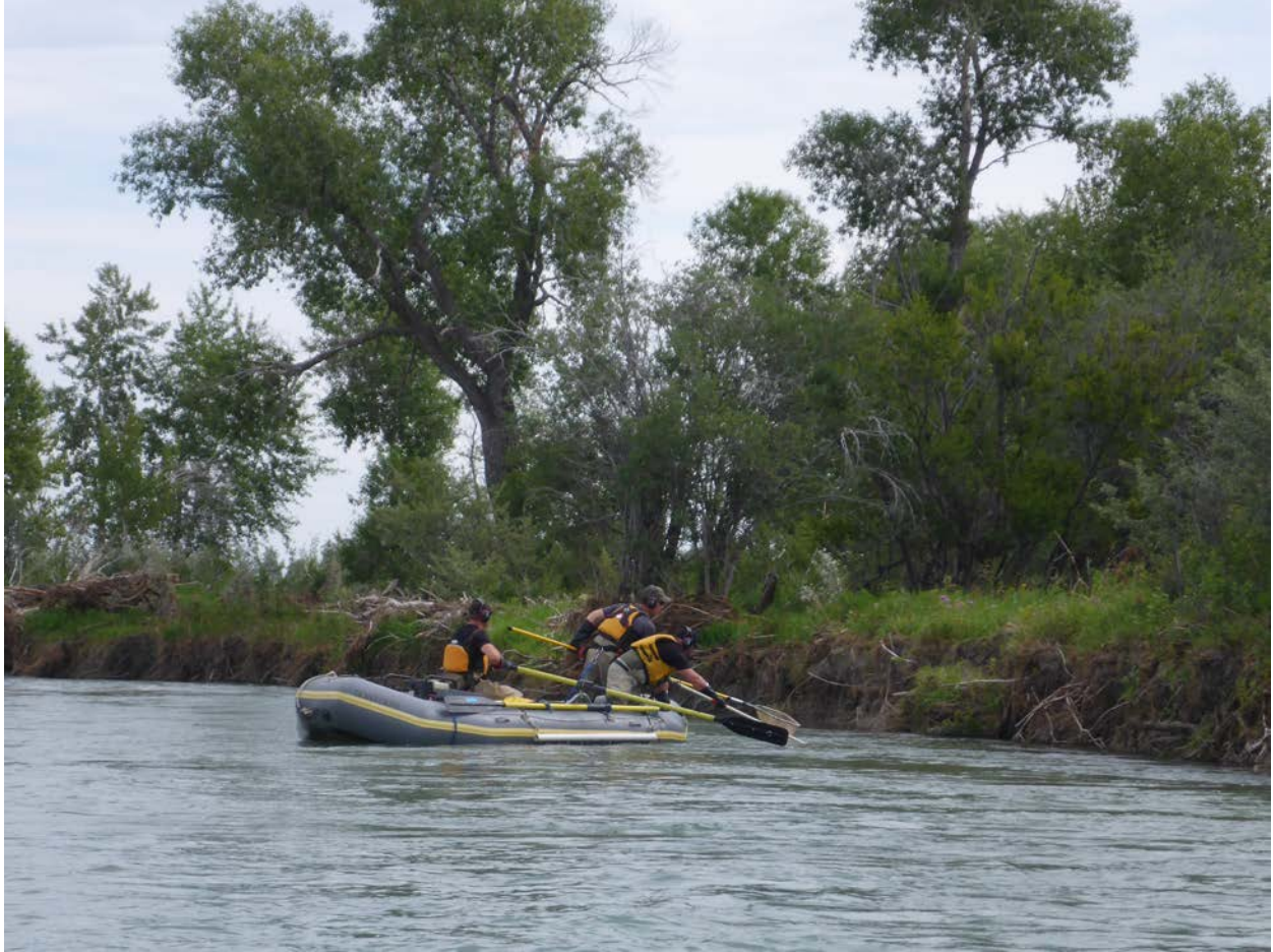
Alberta Conservation Association float-electrofishing crew on the Waterton River tailwater.