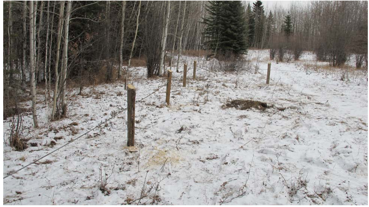
Parking area developed on the Walters Conservation Site. This parking area will help facilitate and control recreational access to this site.