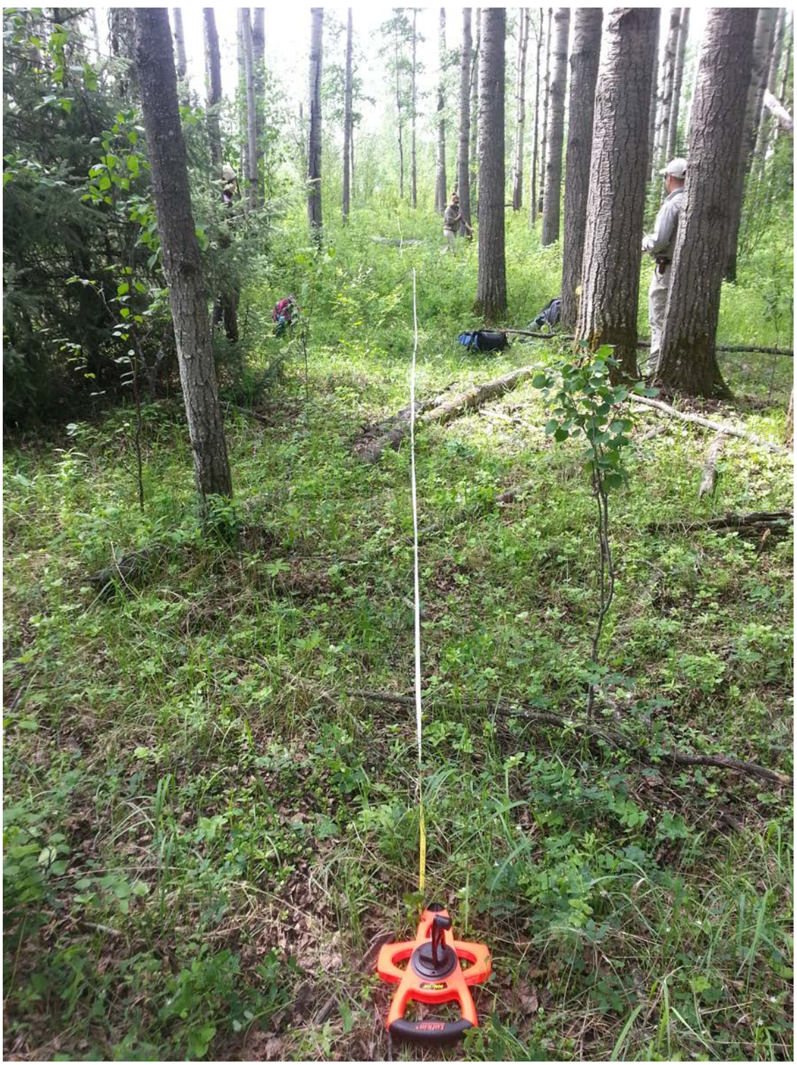
Alberta Conservation Association staff at the North Fawcett 6 Conservation Site completing habitat inventories that provide information on species and conditions at the site and assist with identifying potential habitat enhancements.