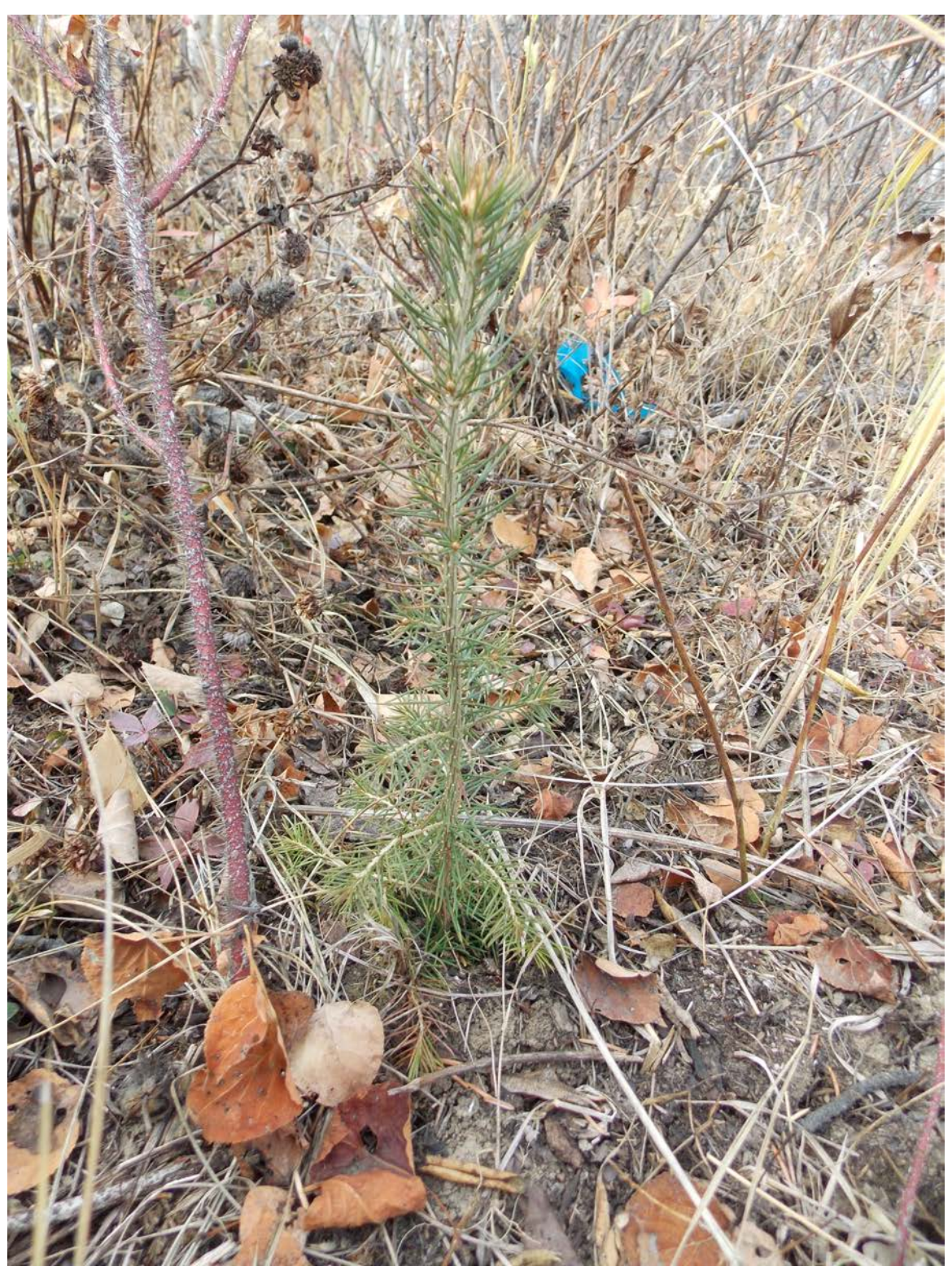
White spruce planted at the Shell True North Forest Conservation Site. Several thousand trees have been planted at this site.