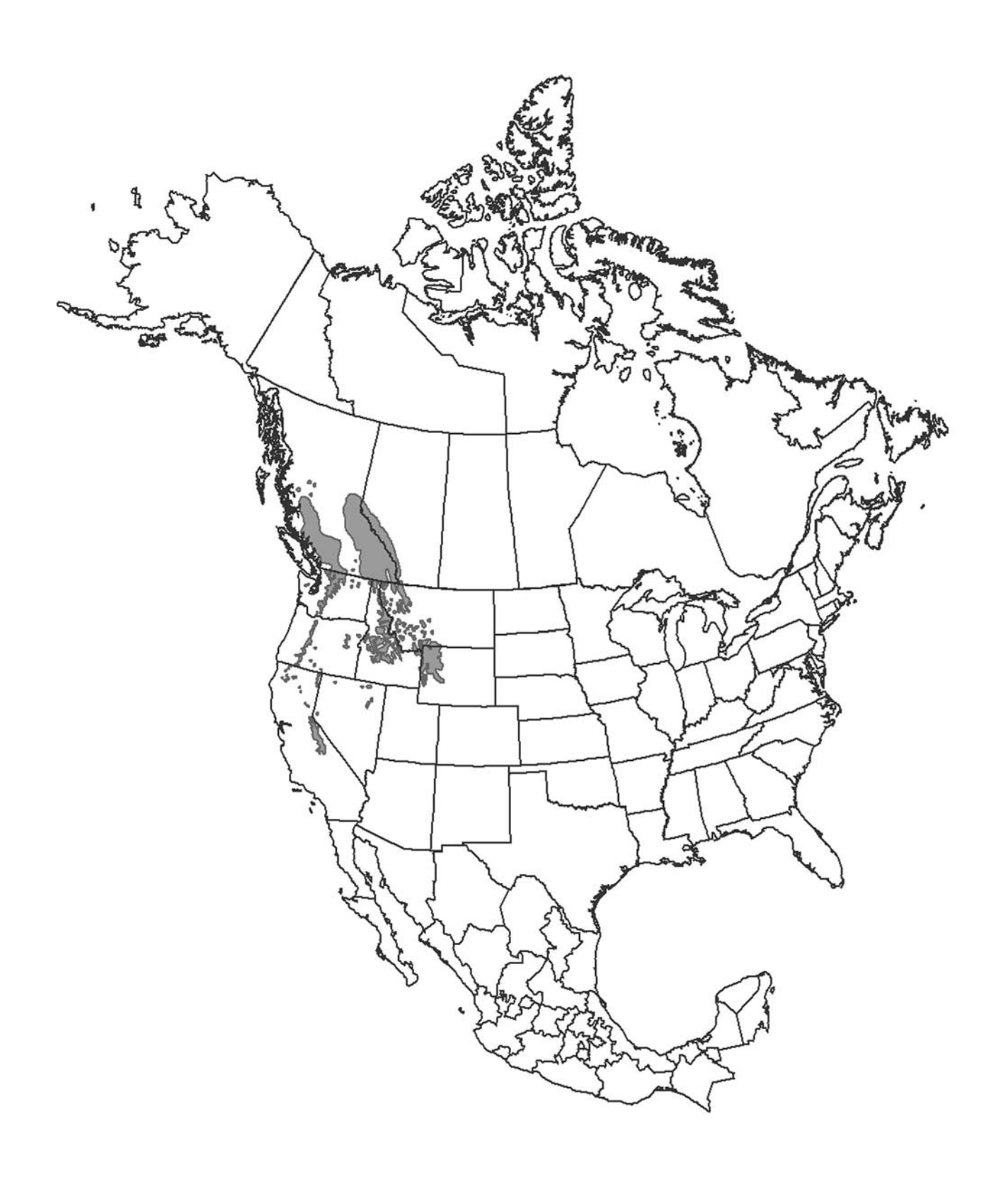
Figure 1. The continental distribution of whitebark pine. Adapted from U.S. Geological Survey (1999).