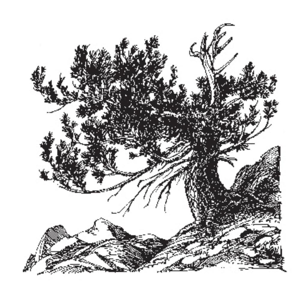
Alberta Wildlife Status Report No. 63