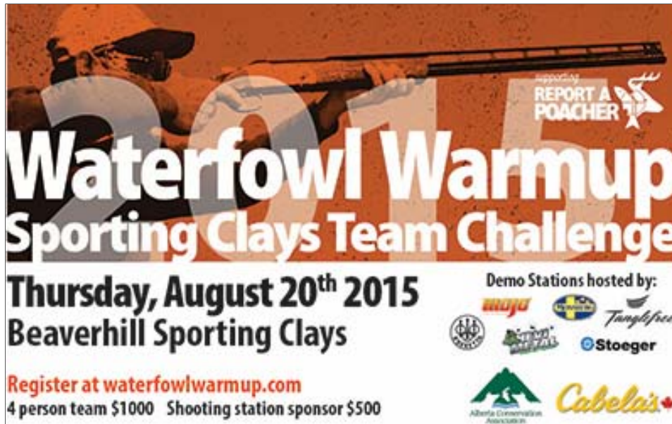
Banner ad on Alberta Conservation Association's website.