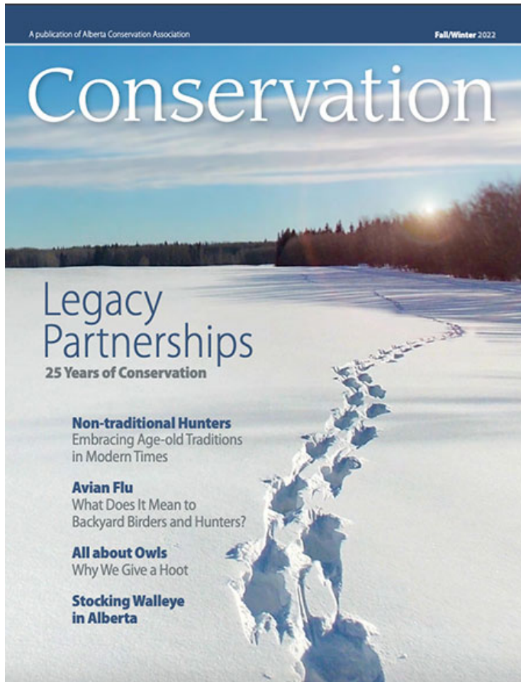
Photo 2. Front cover of the 2022 fall/winter edition of Conservation Magazine .