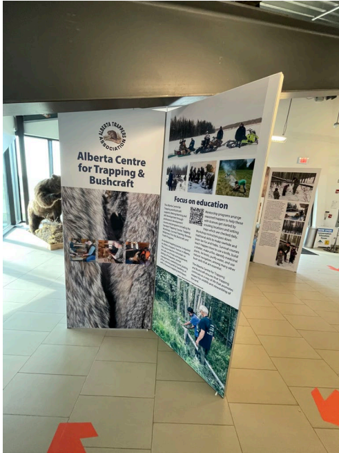
Photo 3. An installed display shown situated in the Conservation Room for the Alberta Trappers exhibit.