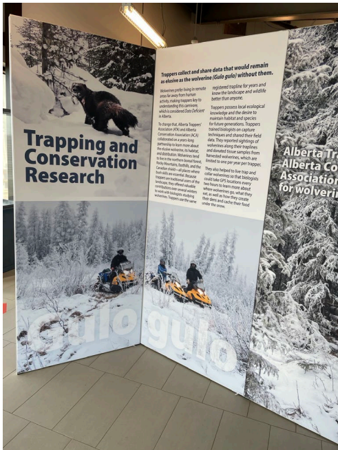
Photo 2. Installed display for the Alberta Trappers exhibit.