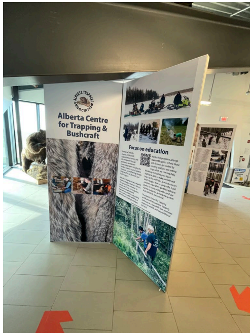
Photo 3. An installed display shown situated in the Conservation Room for the Alberta Trappers exhibit.