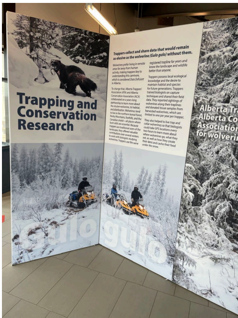
Photo 2. Installed display for the Alberta Trappers exhibit.