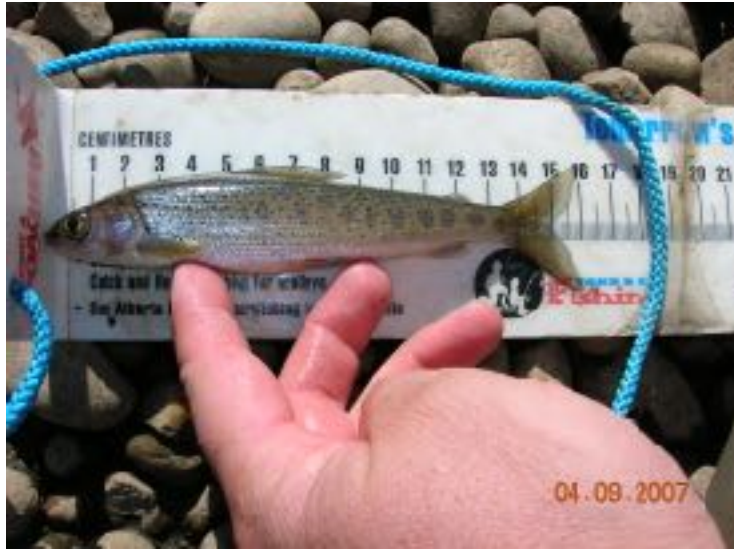
Arctic grayling from the Little Smoky River.