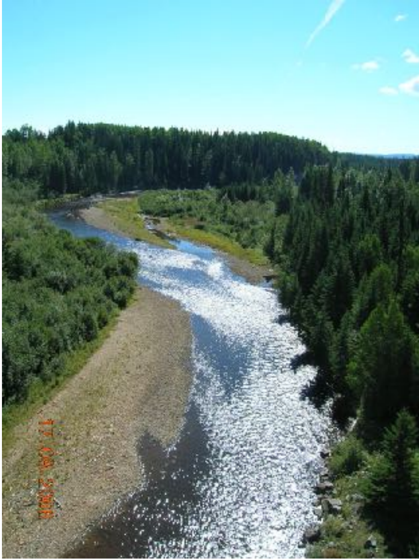
Little Smoky River within the study area.