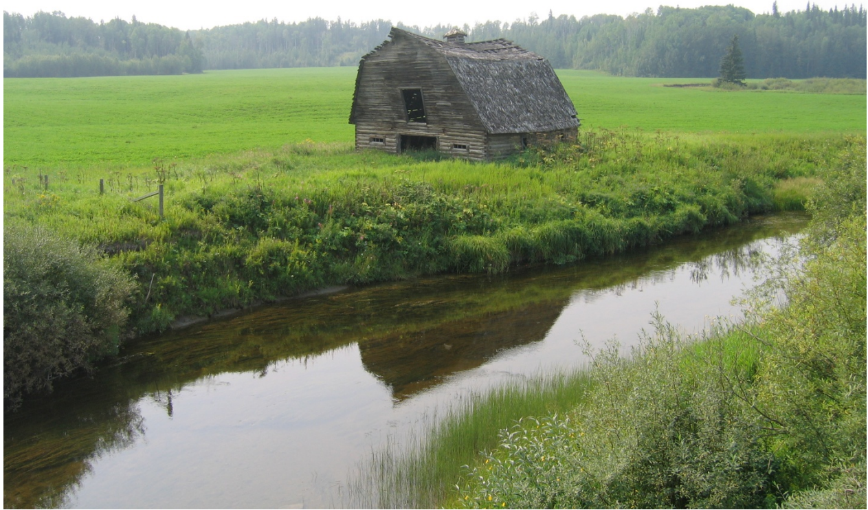
An abandoned barn indicating the long history of development and use of riparian areas along the Edson River.