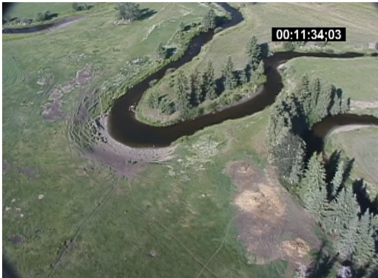
Sample image from videography showing severe degradation of streambanks related to intense grazing and watering of cattle in the river.