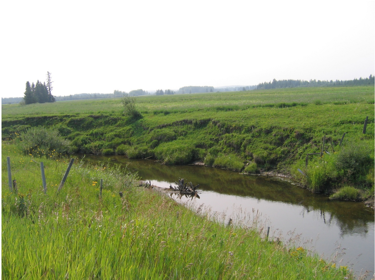
A potential riparian enhancement project site showing river bank instability and slumping caused by grazing, cultivation and removal of trees.