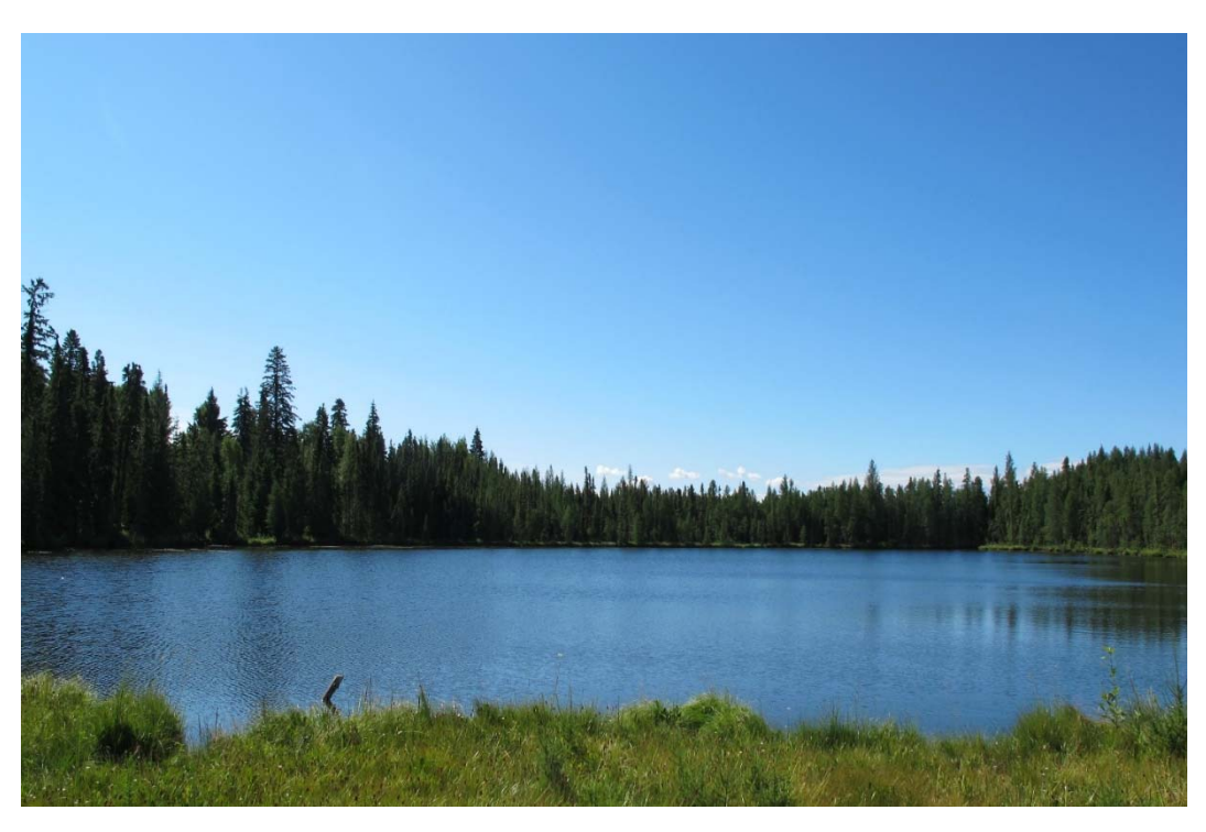
Enhanced Fish Stocking project candidate waterbody EFS 199, located approximately 89 km west of Edmonton.