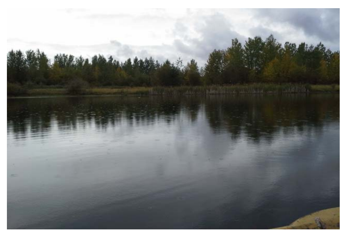
Enhanced Fish Stocking project candidate waterbody EFS 203, located approximately 169 km southeast of Grande Prairie.