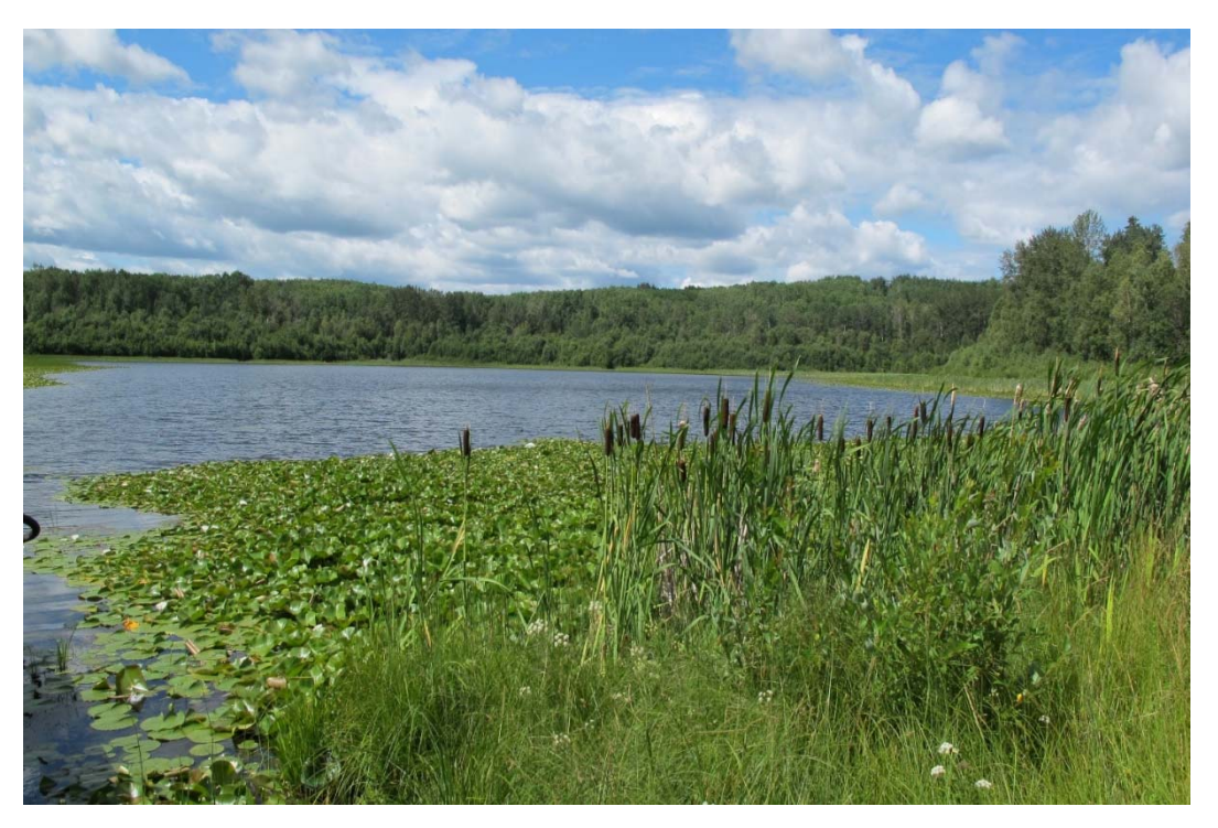
Enhanced Fish Stocking project candidate waterbody EFS 124, located approximately 44 km west of Edmonton.