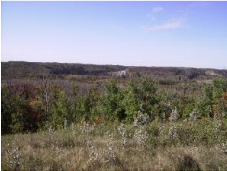
Spruce Coulee Conservation Site