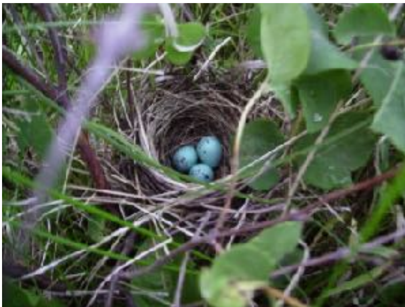
Clay-colored Sparrow Nest on Caine 3 Conservation Site