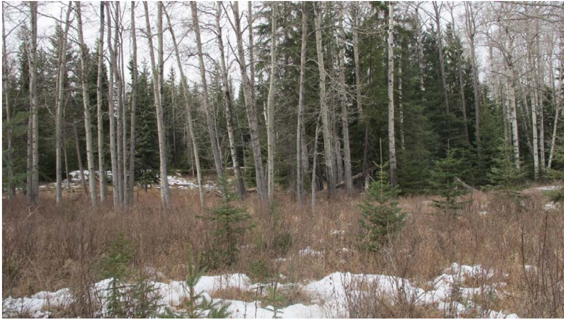
Mixedwood forest at the Drake Conservation Site in our Central Region.