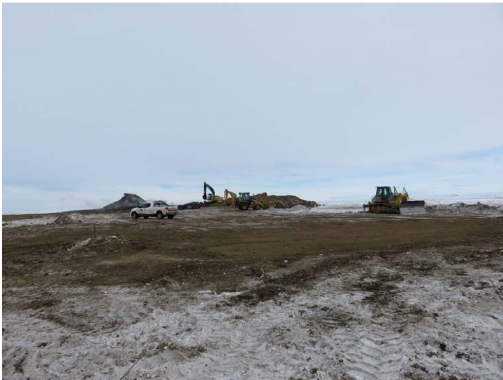
Farm site demolition and preparation for reclamation at the Silver Sage Conservation Site (expansion) in our Southern Region.