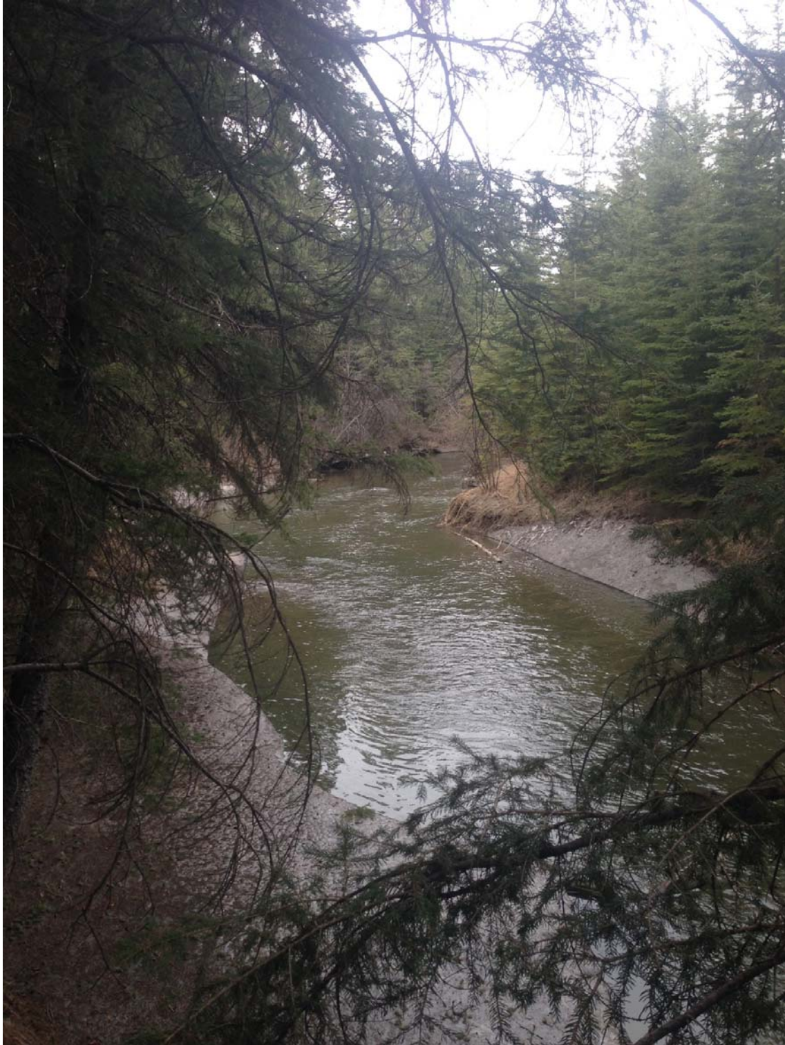
Riparian and stream habitat along the Raven River at the Drake Conservation Site in our Central Region.