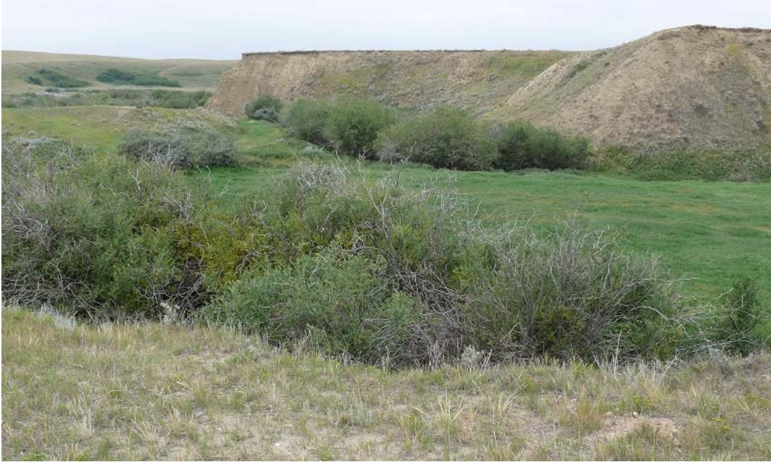
Riparian habitat along a coulee at Silver Sage Conservation Site (expansion) in our Southern Region.