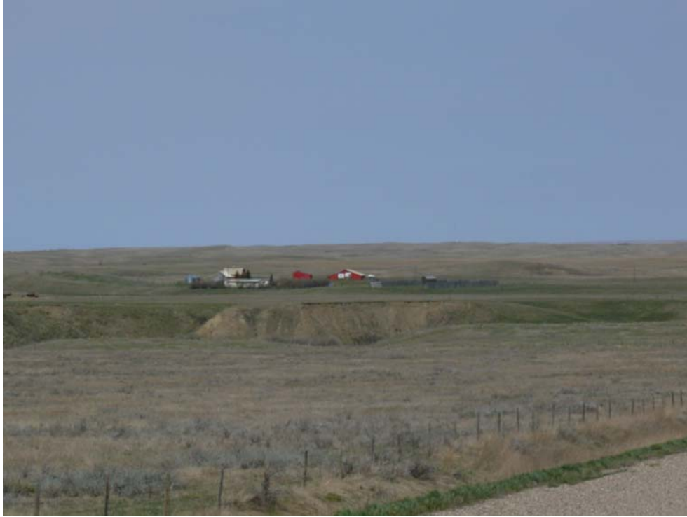
Farm site before demolition and reclamation at the Silver Sage Conservation Site (expansion) in our Southern Region.