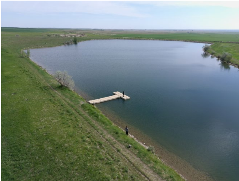
Photo 4. Trout pond on McVinnie Fisheries Access Site (South Region).