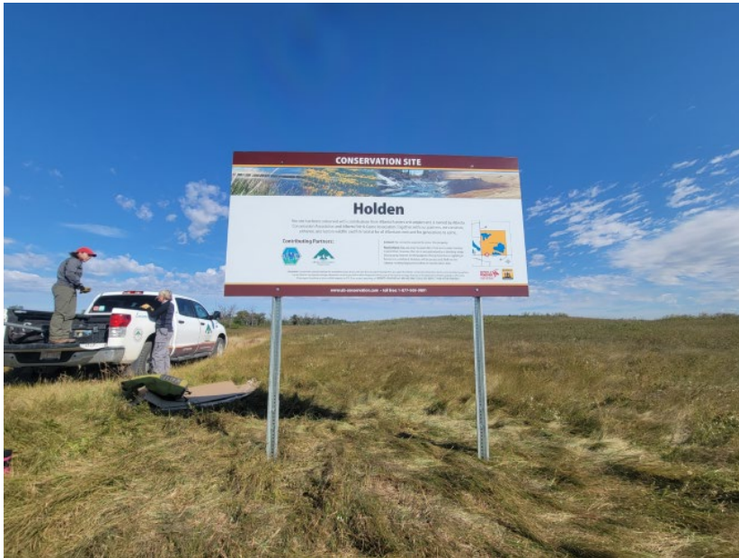
Photo 2. Installed project sign at Holden Conservation Site (Northeast Region).