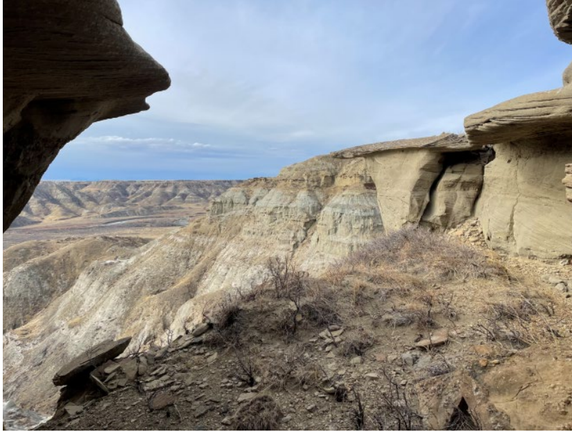
Photo 5. Coulee on Milk River Badlands Conservation Site (South Region).