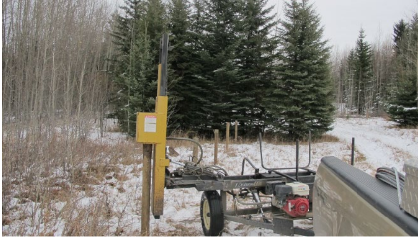
Photo 3. Installing fence posts for a parking area on Walters Conservation Site (Central Region).