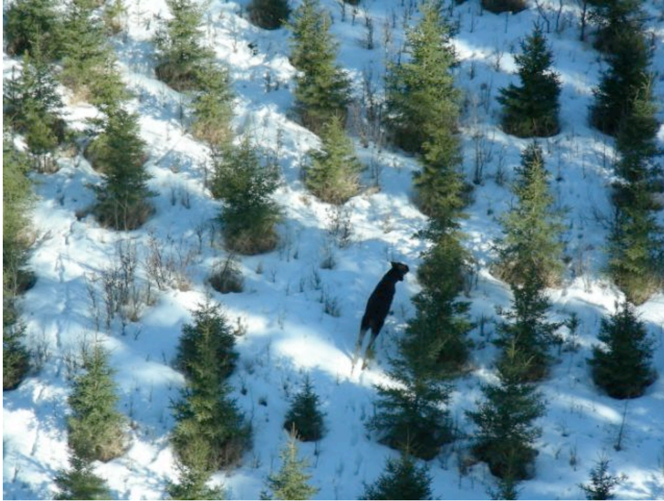
Moose are one of the target species for aerial ungulate surveys conducted by the ACA.