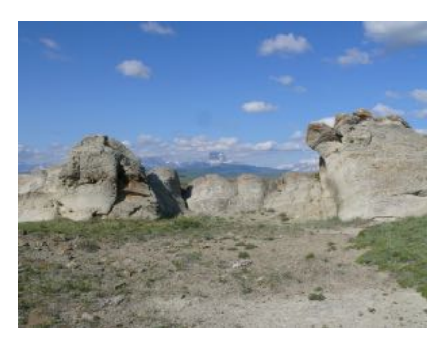
Hoodoo formations