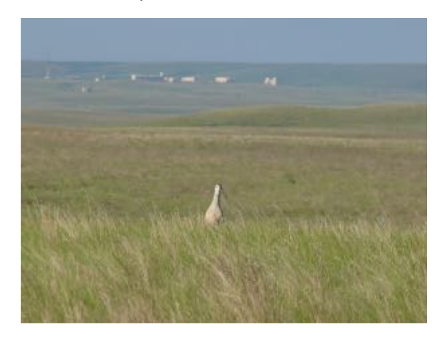
Long-billed curlew, species of 'Special Concern', in native grassland