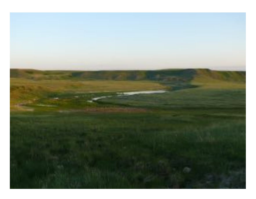
Milk River and surrounding native grasslands