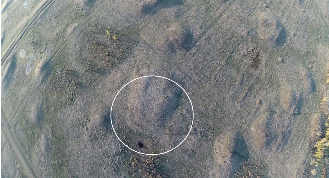
Figure 3. Aerial view of an active sharp-tailed grouse lek site from an unmanned aerial vehicle flying about 100 m above ground. Sharp-tailed grouse are occupying the hill in the centre of image, but they are not readily visible.

The sharp-tailed grouse that were active on the lek that day appeared to be wary of overhead objects. At 150 m high, birds stopped dancing and remained still. Although this could have been coincidental with periodic breaks that are a normal part of lekking, we assumed that the birds were responding to a perceived threat. At 100 m high, all individuals at the lek flushed to cover. Again, we assumed that this was a response to an elevated perception of threat from the UAV.