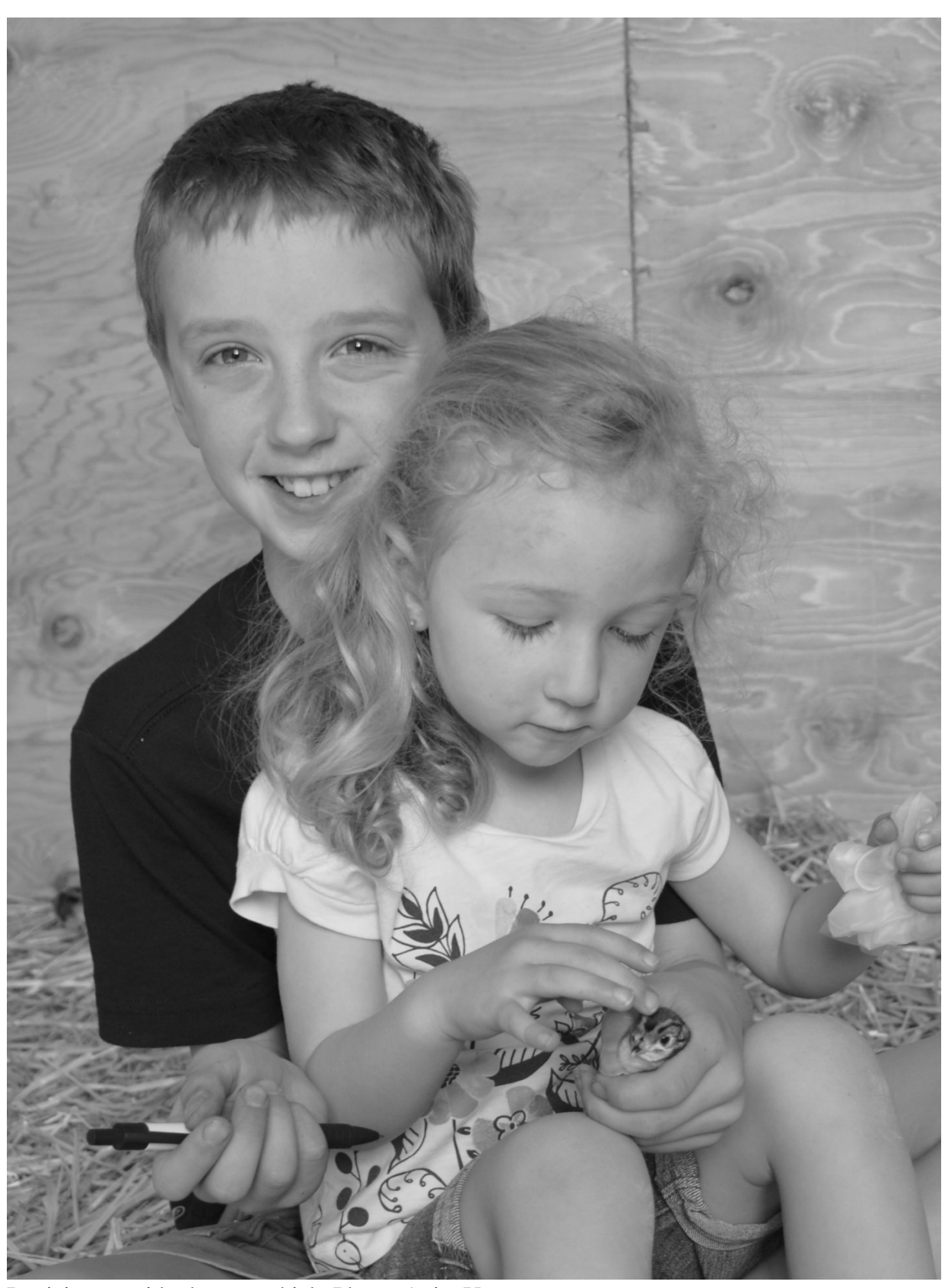
Participants with pheasant chick.