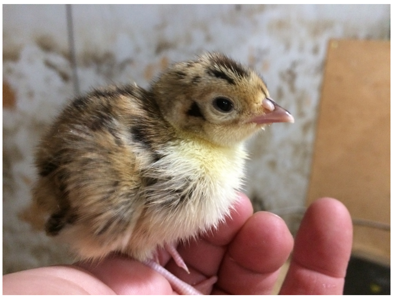
Day-old pheasant chicks delivered to 4-H members.