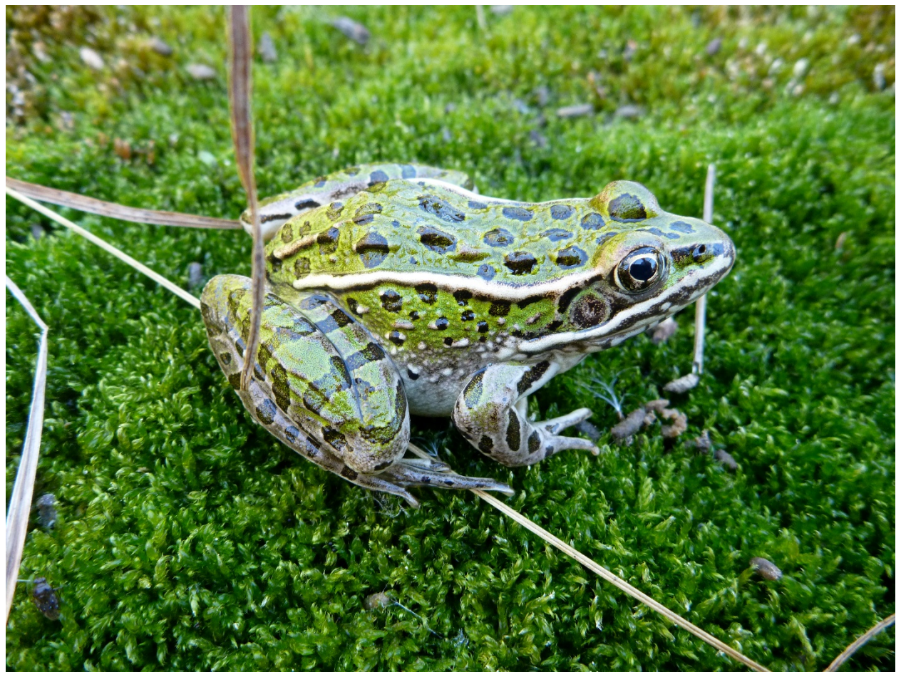
Northern leopard frog near Jenner, AB.