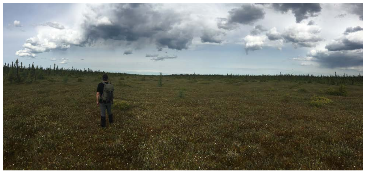
M6's collar retrieval was only a few kilometres from the border of Wood Buffalo National Park in the far north.