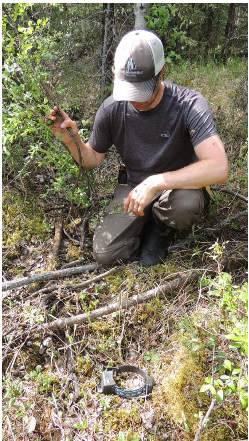
M6's collar was located in a small wooded valley that was surrounded by an expanse of bog and fen.