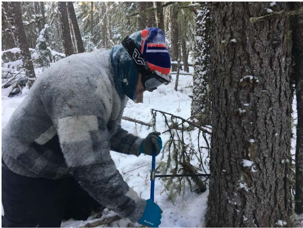
Determining the age of the forest where wolverines chose to establish their dens will help us to better understand the type of habitat that is important for their long-term conservation. This can be done by taking a tree core and counting the rings.