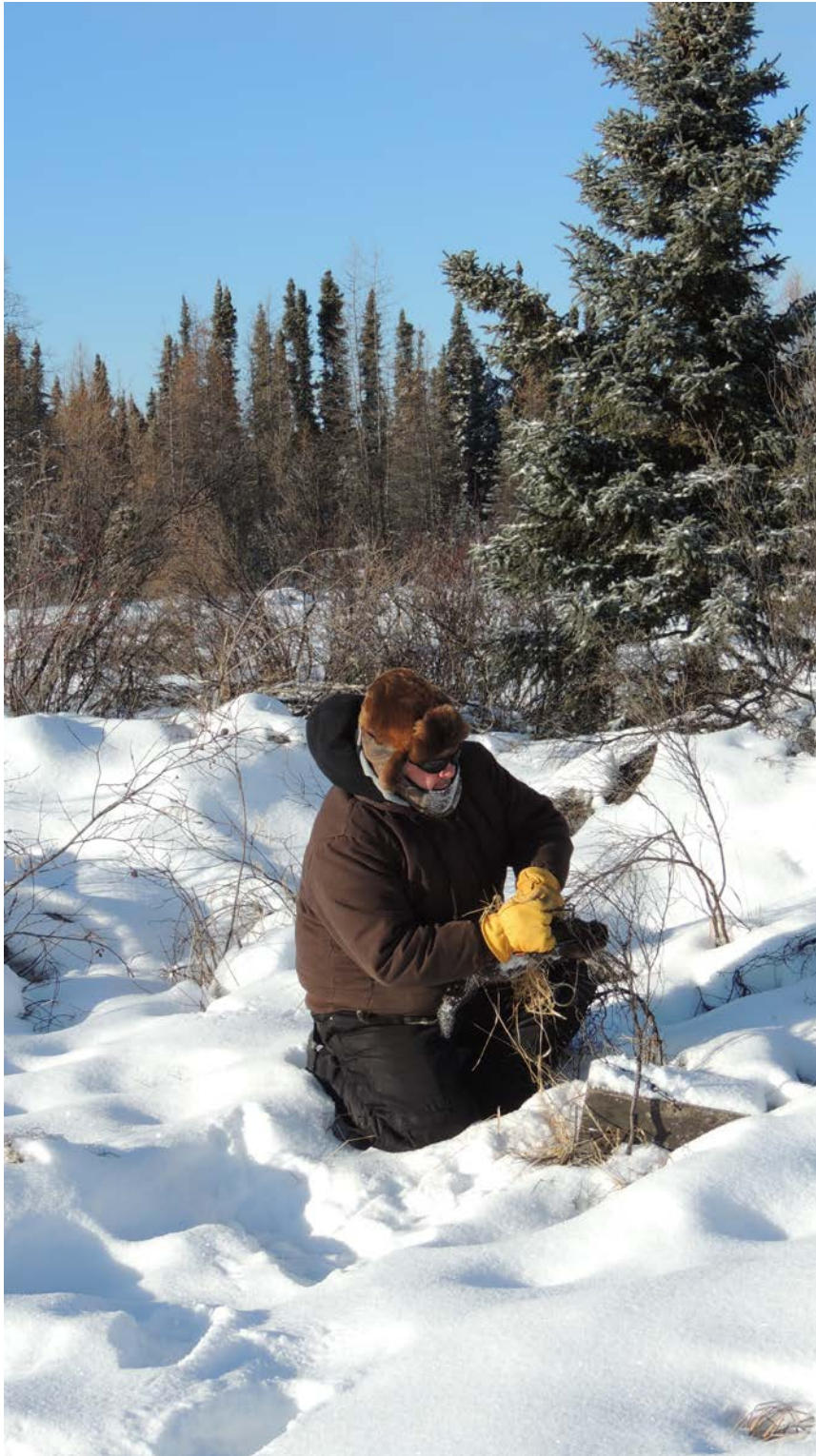
A trapper collects a harvested wild mink from a trap. The initial logbook pilot data indicated that fewer than one in five of the participating trappers caught one of these semiaquatic mustelids.