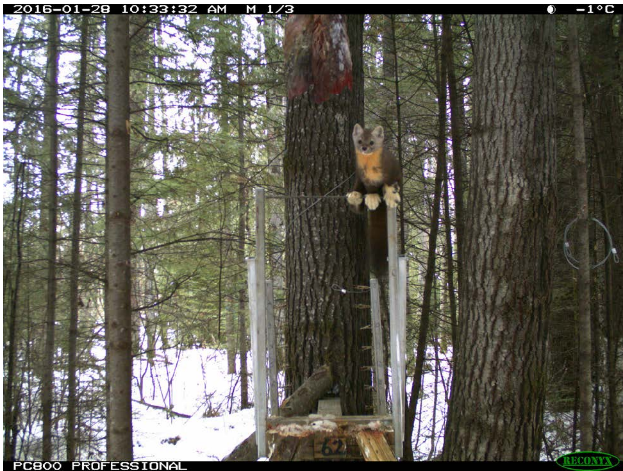
Marten are a beautiful and much-desired furbearer in Alberta. This curious marten was captured on camera as part of an earlier project to study wolverines.