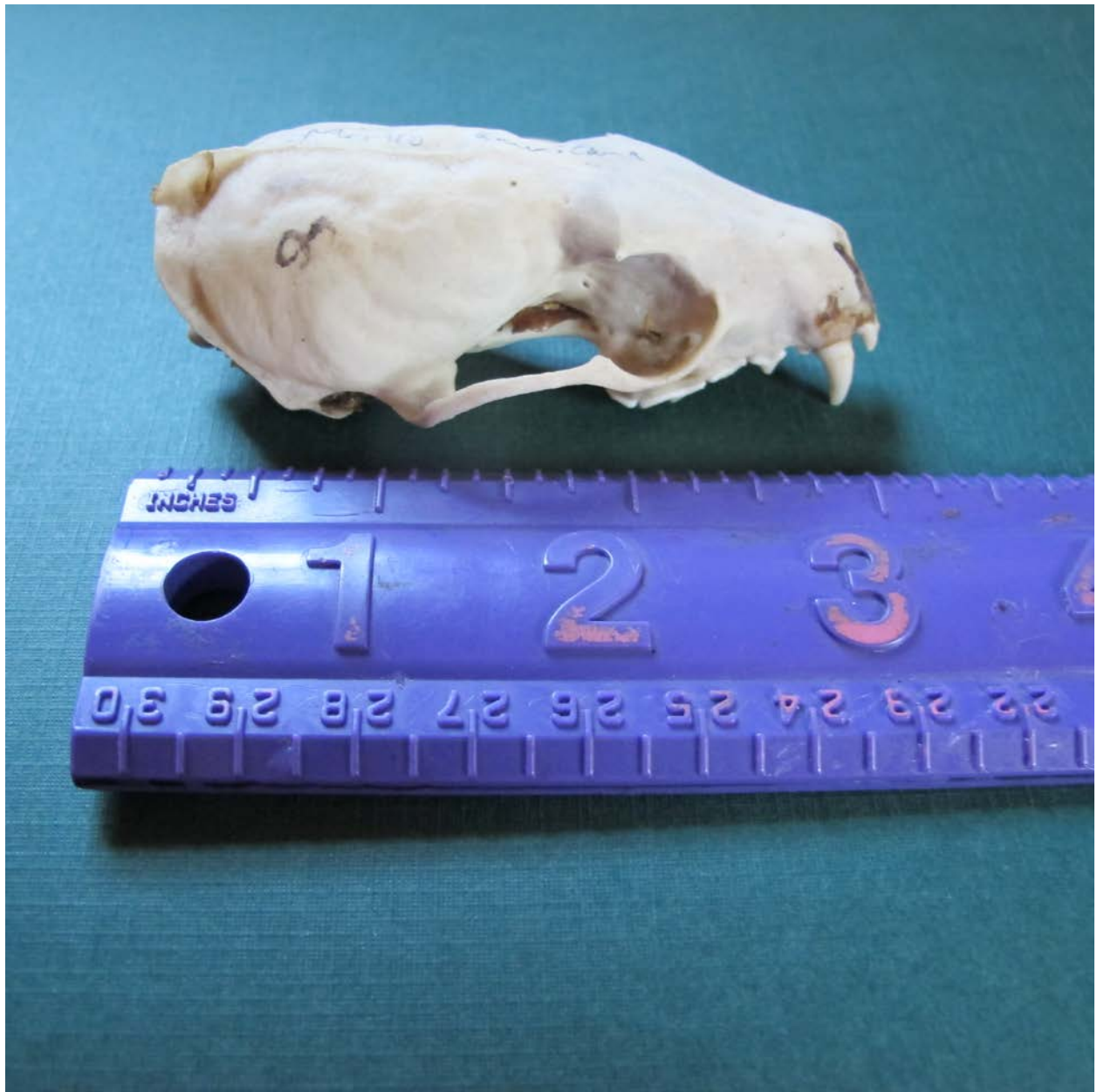
Researchers in Alaska discovered that measurements on a marten skull can tell you whether the animal was a male or female, juvenile or adult. We're going to test this method with trappers in Alberta.