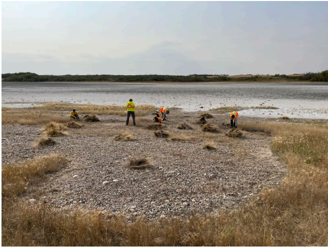
Photo 1. ACA employees removing vegetation on created piping plover breeding habitat.